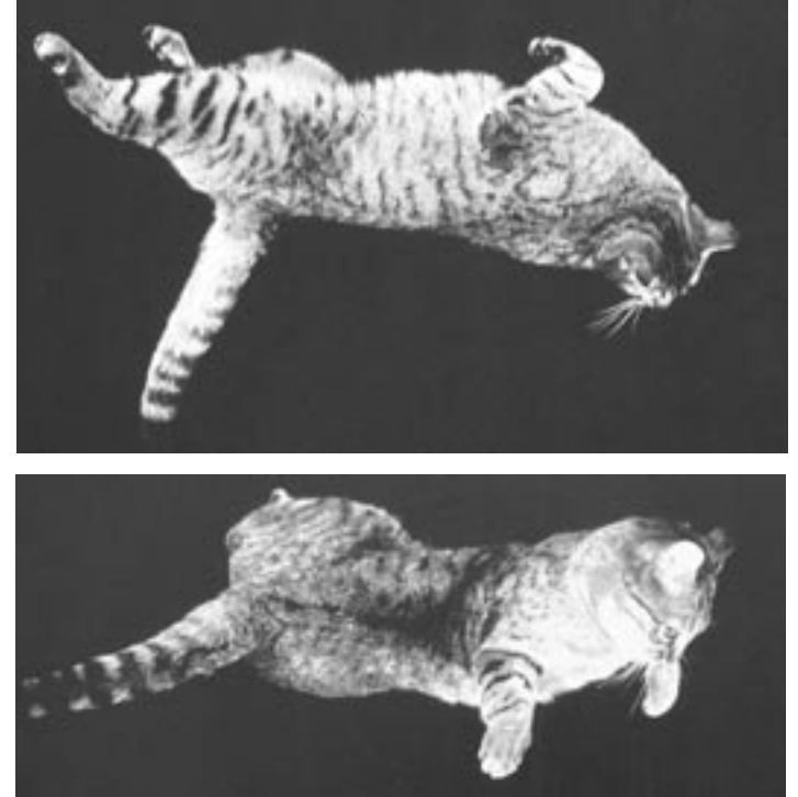
Illustrations 4 and 5: Cat turning during a fall.

After several lessons we had usually practised turning over on the floor to get up. This may seem somewhat early in a course of lessons for such an apparently complicated movement. However, turning over in bed to get up (especially in the night) is particularly difficult for people with Parkinson's, and of vital importance to quality of life. It also helps a great deal in locating the head on the spine and experiencing the power of allowing the head to lead. We used the model of vertebrates – cats, horses, tortoises – getting up from their backs.